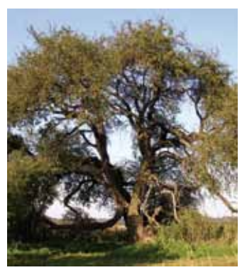
Pear tree (Pyrus communis pyraster).