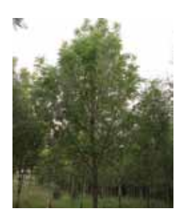
Valuable broadleaved accompanied by birch.

This scheme consists on utilizing auxiliary species whose function is to enhance the shape and/or the productivity of the main species (pear tree or other valuable broadleaved species). These accompanying species can improve the shape of the main species through a lateral shading, forcing the main species to grow straight and with few branches. Moreover, a higher growth rate of the main species can be also achieved with accompanying species able to fix atmospheric nitrogen on the soil (e.g. alder) or producing a high quality humus (e.g. birch). The distance between accompanying and main species has to be carefully chosen, and proportional to their growth rate.