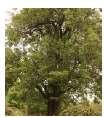
Apple tree (Malus sylvestris).