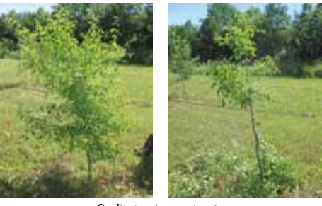
Quality pruning on a pear tree.

Pear tree pruning criteria are similar to other valuable broadleaved species. The main peculiarity is linked to its horizontal branching pattern, which reduces the risk of forking occurrence and branches competing with the terminal shoot. However, the risk of wavy-shaped stems is higher. To avoid this problem, as well as the emergence of epicormic shoots it is recommended to apply frequent (annual or bi-annual) prunings of moderate intensity, eliminating all branches with a diameter larger than 2.5-3 cm at their insertion point. It is also recommended not to remove all branches in more than a third of total tree