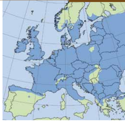
Distribution of European ash (Fraxinus excelsior).

In areas with Mediterranean climate, they are located in mountainous areas, along shady areas besides water streams. In the Iberian Peninsula they are located especially in the northern area.