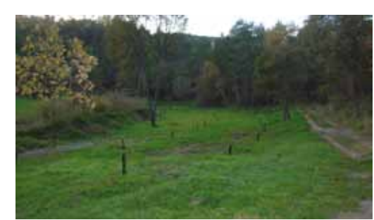
Plantation in former pasture land in mountainous Mediterranean area.