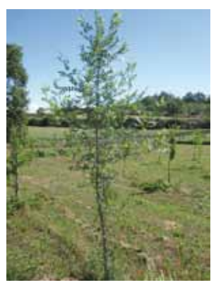
Narrow-leaved ash plantation.

Narrow-leafed ash plantations are not very common in Europe yet, leading to a lack of silvicultural guidelines specific for this species. Thus, its seems appropriate to use it in combination with other species, and to consider a silviculture similar to the one of European ash, regarding plantation density, pruning, thinning and rotation, provided that the site features are adequate for this species. The quality of the timber of narrow-leafed ash is generally not as good as in the case of European ash, because of its tendency to generate a large amount of branches and show a wavy growth pattern.