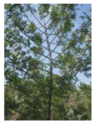
Tree shape and branchiness of an unmanaged tree.